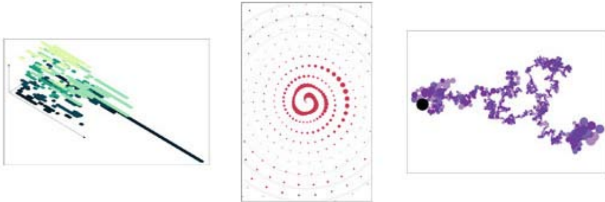
A few examples of my illustrations created by programming.

The actual final installation of my project consists of five songs that one can listen to through headphones attached to the walls of the gallery. The music is played in sync with the moving visualization that is associated with that song which plays on a TV set into the wall. Above each TV hangs a print taken from the video as a single frame or a completed drawing that the visualization creates when it runs. This way a viewer can experience the song in real time, while also experiencing the moving visualization, which is the halfway point between the static visual output,