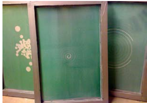
Exposed screens, ready to print.

blocks by having it follow a digital file I feed into it. When I have my blocks, screens, or plates cut